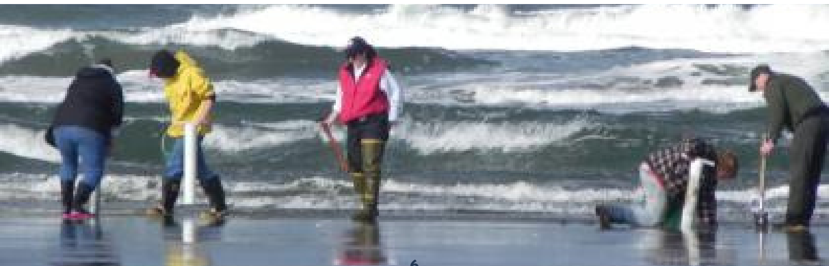
Razor clamming at Twin Harbors.

Licenses, ranging from a three-day razor clam license to an annual combination fishing license, are available from WDFW's licensing website at https://fishhunt.dfw.wa.gov/login , and from hundreds of license vendors around the state. WDFW recommends buying your license before visiting coastal beach communities for this razor clam season.